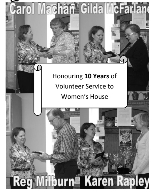
Honouring 10 Years of Volunteer Service to Women's House