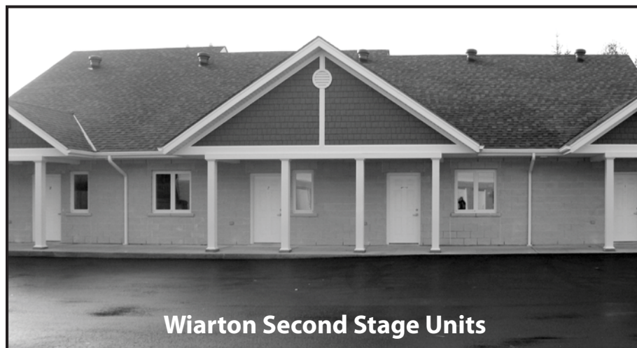
Wiarion Second Stage Units

Women’s House is proud to serve both Bruce and Grey counties in order to reach as many women in our surrounding communities as possible. We offer individual outreach counselling in Chesley, Durham, Hanover, Kincardine, Markdale, Meaford, Owen Sound, Port Elgin, Southampton, Walkerton and Wiarion.